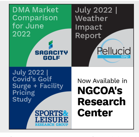
The NGCOA partners and participates with industry experts to provide members with timely, business-critical reports, studies and other research content.