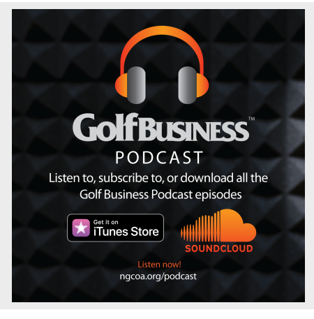
The Golf Business Podcast brings you informative content to help your golf course business thrive.