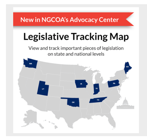
The NGCOA strives to provide guidance, interpretation and suggestions for action when it comes to industry related challenges.

Thanks to Topgolf and Drive Shack and Popstroke and Puttery and X Golf and Toptracer Range, and indoor coaching centers like Golfinity or 5 Iron Golf, the game finally has a diverse and welcoming array of entry points. People who have never swung a club now encounter a myriad of golf opportunities ... READ MORE >>